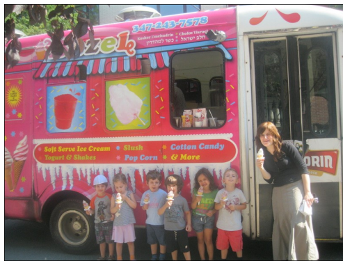
A visit from the Kosher Ice Cream Truck!