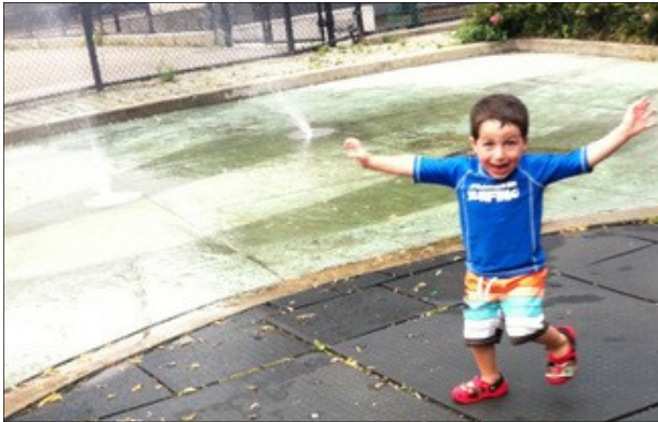
Water Fun & Outdoor Playground